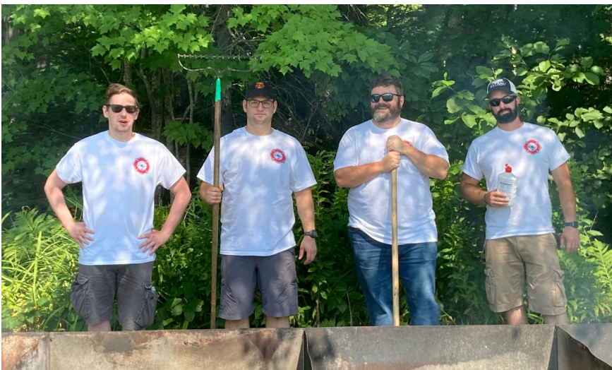
Manning the barbeque pits

Thanks to everyone who joined us for the Vienna Fire Department Chicken BBQ this year! With your support, we sold over 400 meals. We are overwhelmed with gratitude and can't wait to do it again next year! Save the date for July 30, 2023!!!