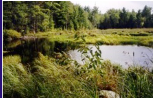
The Small Woodland Owners Association of Maine's Ladd Forest property in Vienna

Email: gilmans2@fairpoint.net web: barbshandpainted.craftah.com