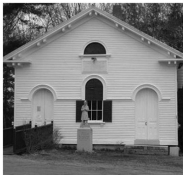
Vienna Town House - Rte. 41, Vienna, ME

1st & 3rd Tuesdays of every month 6:30 p.m. at the Town House